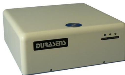
Figure 1: Durasens LSP-T Series Diamond ATR FTIR Analyzer

All the samples were analyzed using the Durasens LSP-T-9 Diamond ATR FTIR Analyzer (Figure 1) that features a built in multiple reflection diamond ATR. The resolution was set to 4 \text{cm}^{-1} and the number of spectra averaged was 32. After the PLS model was created it was imported into the Durasens Analyzer Software that allows straightforward sample spectrum acquisition and analysis.